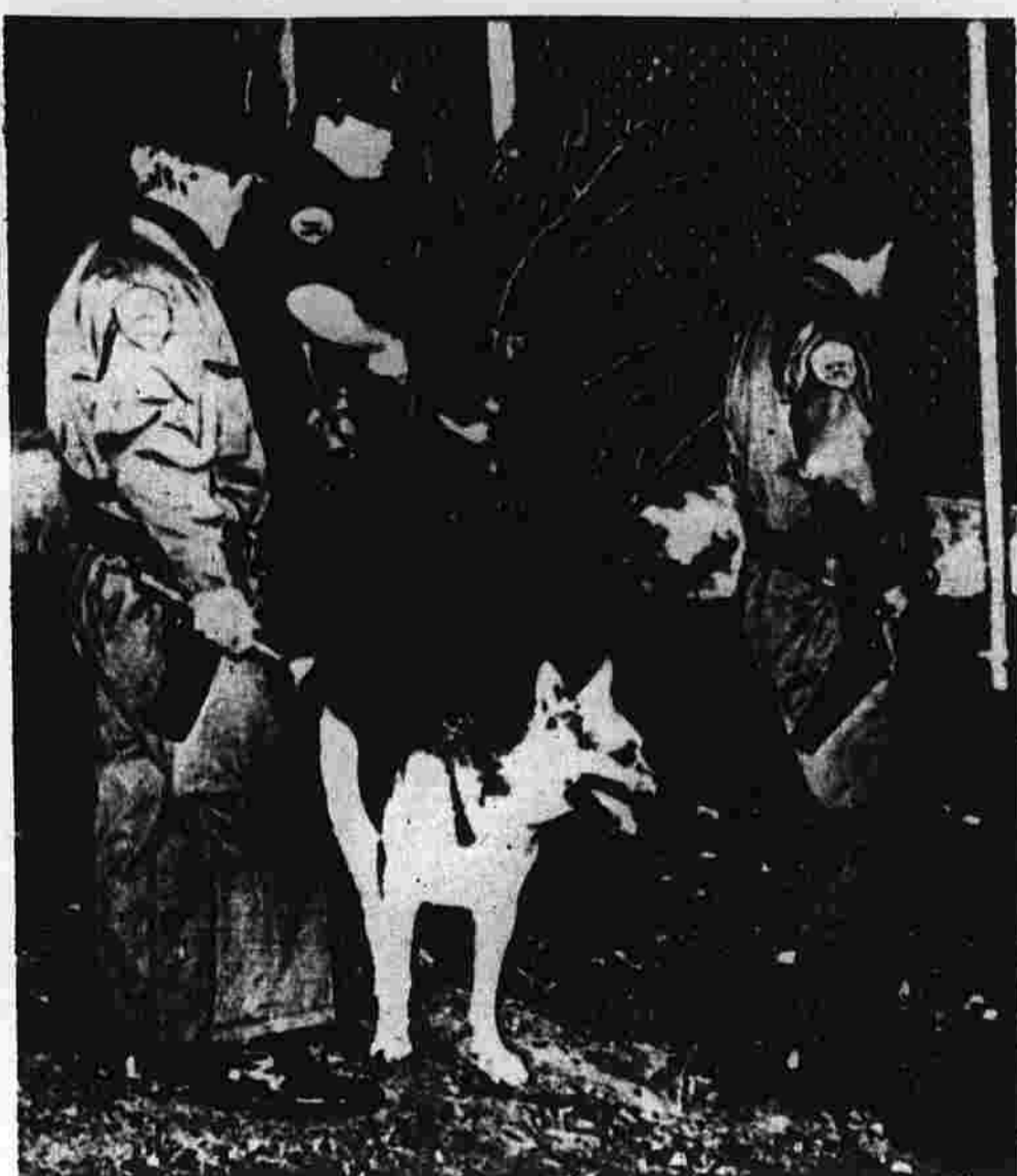
Police search grounds outside police station in San Francisco after a man burst into the station last night and opened fire with a shotgun.

All the repair operations will be completed this afternoon, the phone company said. But regular service calls and installing (See Page Twelve)