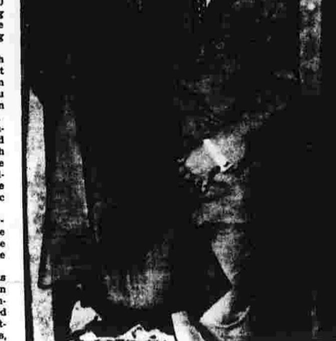
President Thieu leaves voting booth.